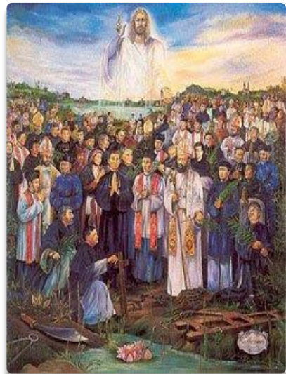
Canonisation illustration, Rome