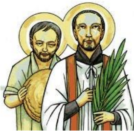
Andrew Dung-Lac to right